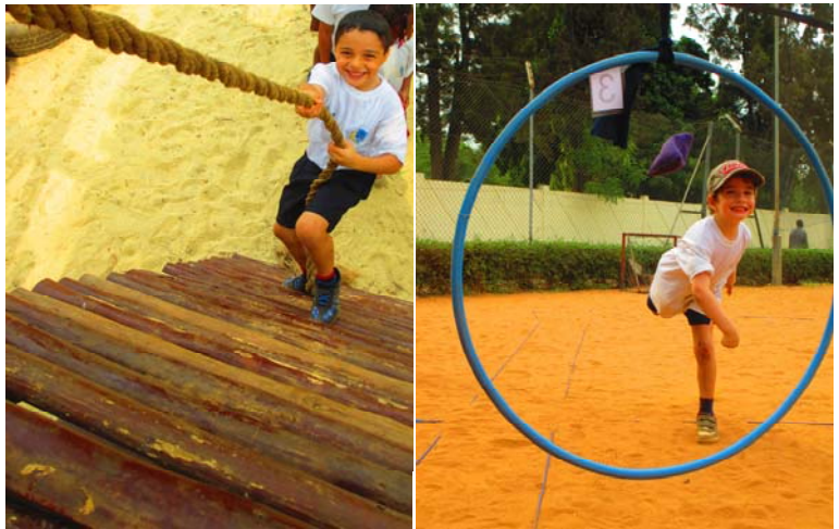
Enriching Lives in the primary school!