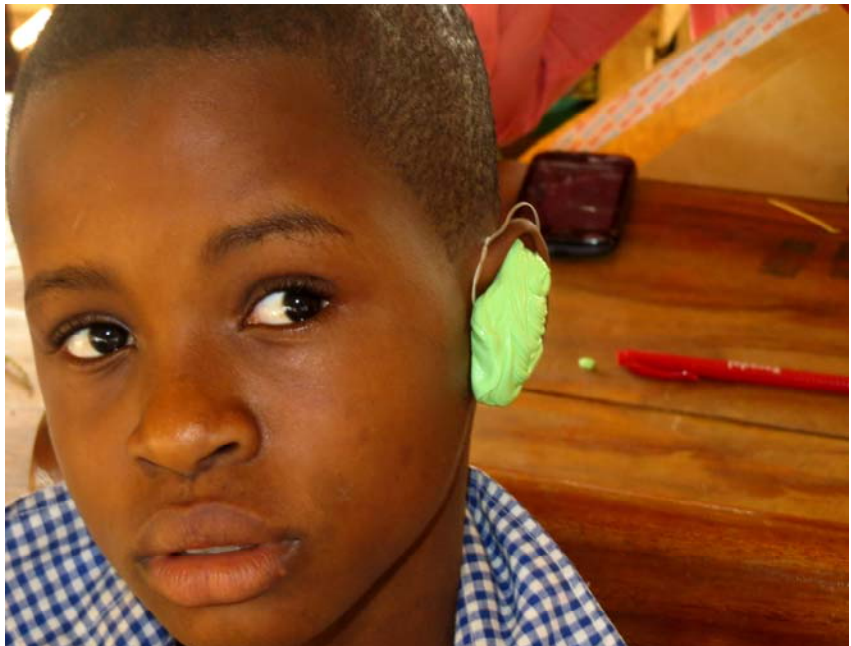
A student from Ephphatha deaf school having a mould made for his new hearing aid! Service in the community is a vital part of life at BSL!

Vivenda Deaf School group has had basketball and football games with the deaf children. The basketball session was such great fun it was filled with laughter the whole time.