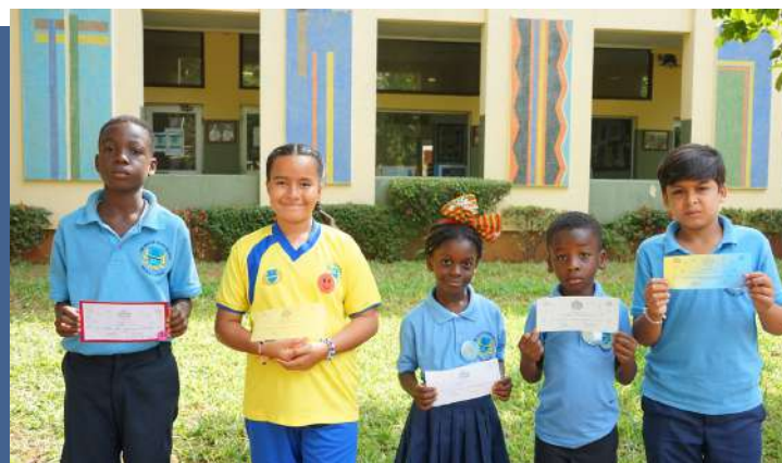
Stars of the week