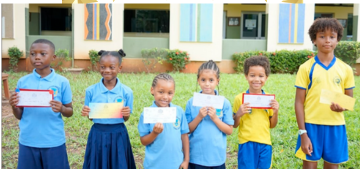
Stars of the week