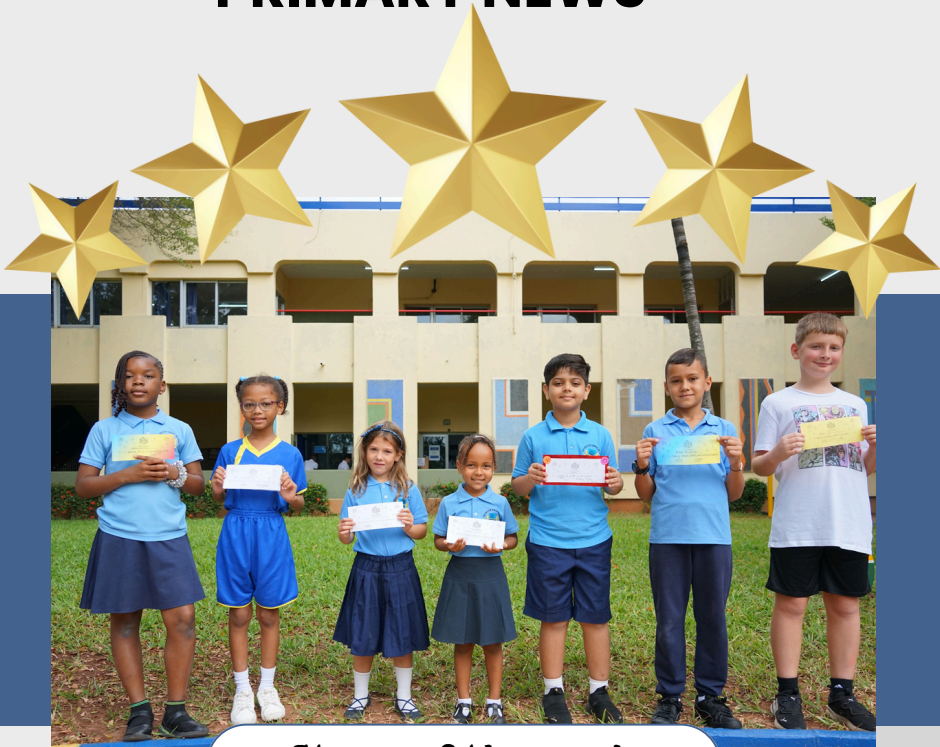
Stars of the week